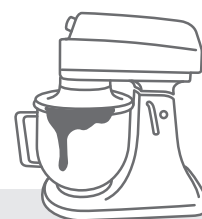
Dirty / used.