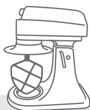
Incomplete and / or without original packaging.