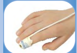
7000P Pediatric Flexi-Form II (10 - 40 kg / 22 - 88 lbs)