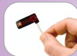
8008J Infant Flex Sensor