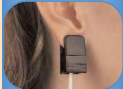
8000Q Ear Clip (> 40 kg / > 88 lbs)