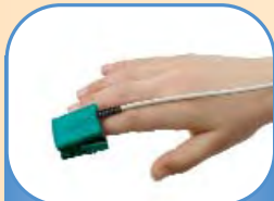
8000AP Pediatric Finger Clip (10 - 40 kg / 22 - 88 lbs)

Nonin has designed an array of PureLight reusable sensors – available for patients of all sizes (adult, pediatric, & infant) and clinical presentations. The 8000 Series of reusable sensors are ideal for short-term monitoring, stress testing and spot checks – any situation where the risk of cross-contamination is low. A comfortable sensor, each is designed for a specific application and is form-fitted to decrease ambient light interference.