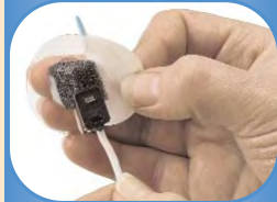
Reflectance Sensor Holder (10 pack w/ 20 adhesive collars)