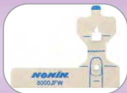
8000JFW Adult FlexiWrap