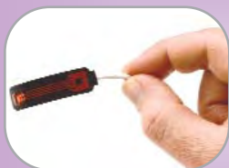
8000J Adult Flex Sensor