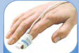
7000A Adult Flexi-Form II (> 30 kg / > 66 lb)

*Optional Reusable Sensor Extension Cables are available in 1m, 3m, 6m and 9m lengths.