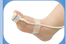
7000I Infant Flexi-Form II (2 - 20 kg / 4 - 44 lbs)