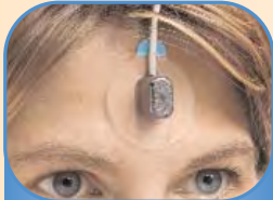
8000R Reflectance (> 30 kg / > 66 lbs)