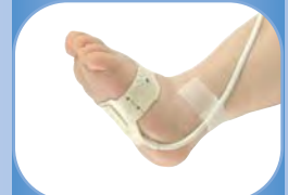
7000N Neonatal Flexi-Form II (< 2 kg / < 4 lbs)