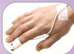
Adult Flex System (> 20 kg / > 44 lbs)