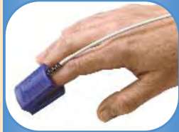
8000AA Adult Finger Clip (> 30 kg / > 66 lbs)