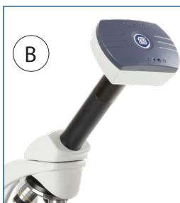
A Trinocular MicroBlue head with mounted camera in photo port