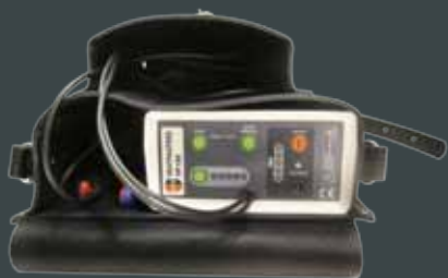
HM190 T/C attachment unit including leather case