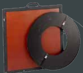
Steel band and the case