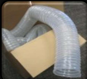
Hoses & Fittings