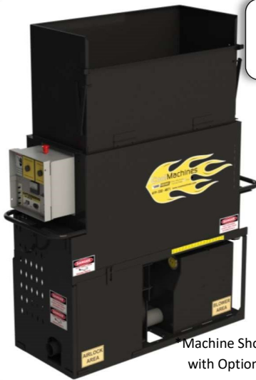
Machine Shown with Options