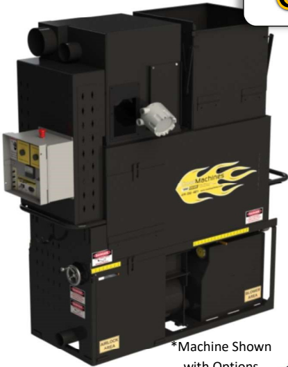
*Machine Shown with Options