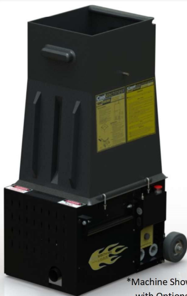
*Machine Shown with Options