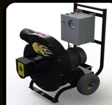
Gas & Electric Vacuums