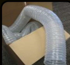
Hoses, Hose Reels, & Fittings