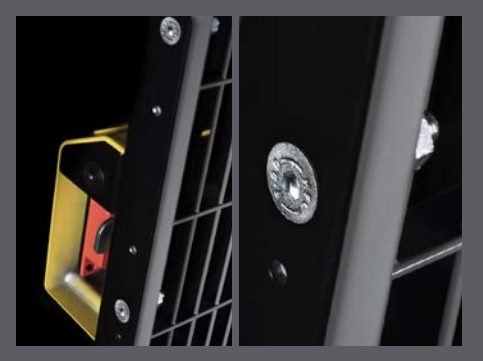
The Safe Lock is easily affixed to the panel frame using only two bolts.

AS SIMPLE AS IT MAY SEEM, IT WILL MAKE IT EASIER TO KEEP YOUR PERSONNEL SAFE AT ALL TIMES.