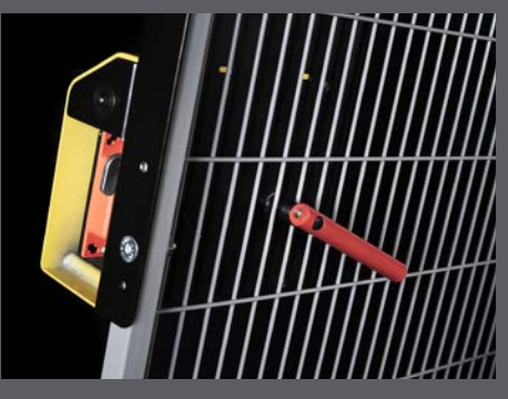
The escape release handle is designed to fit between the existing mesh apertures avoiding the need to cut any wires.