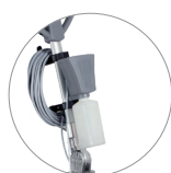
Spray electric system