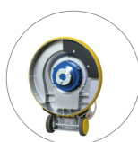
Mount for drive board and brushes