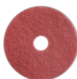
Extensive range of pads and brushes