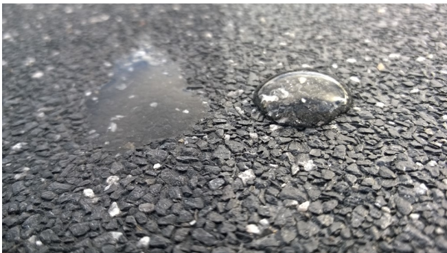
Left: unprotected, water penetrates the surface Photo shows a micro exposed concrete surface