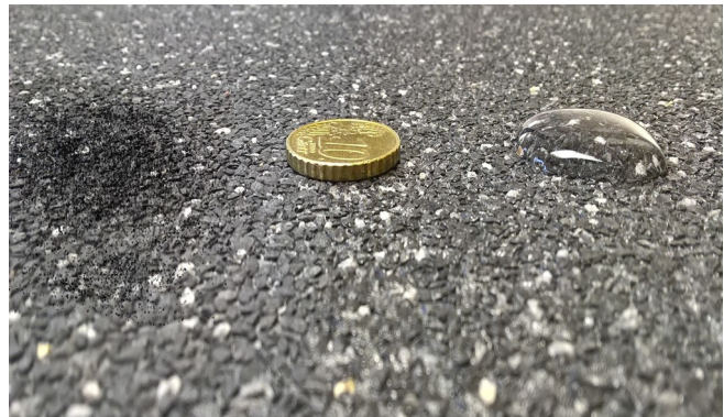
Left: unprotected, water penetrates surface.