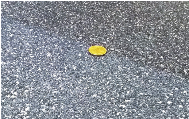
Left at the bottom: unprotected Right at the top: protected COLORFRESH® intensiv is colour enhancing and creates a light, silky shine