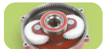
Nylon gear drive for KF 43 and KF 33