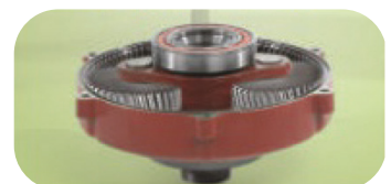
Steel gear drive for KS 43 PLUS