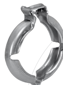
VPP Clip (Snap-in closure)