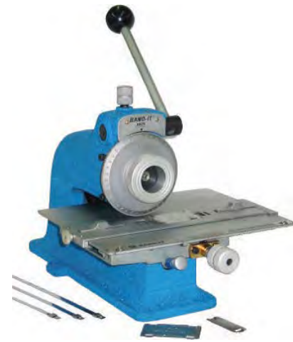
ID Tag Imprinter Tool

An ID Tag imprinter is available with a choice of character sizes.