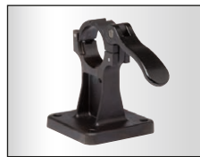
Part #800506 Bench Mount Fixture

Part #800293: Battery only Part #800294: Charger only