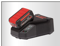
Part #800521 Spare Battery and Charger

Part #800293: Battery only Part #800294: Charger only