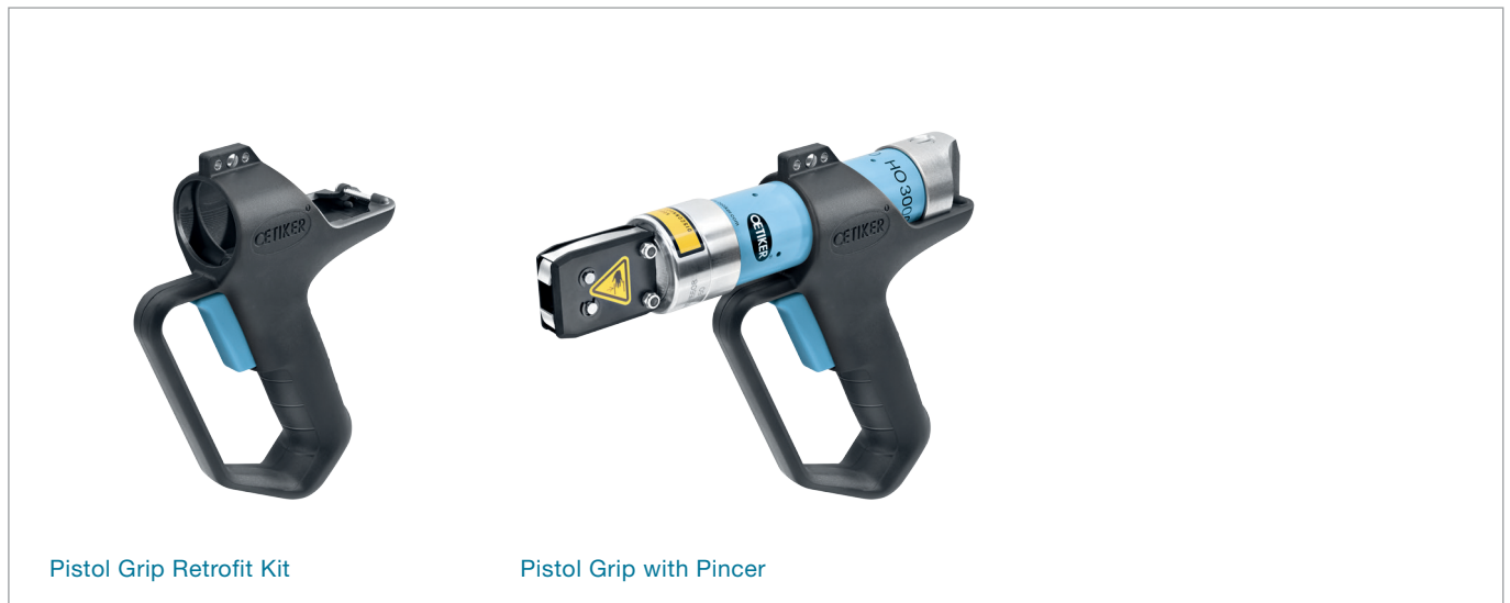
Pistol Grip Retrofit Kit