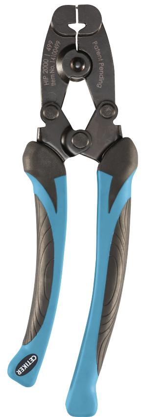
Compound Action Pincer - Side Jaws - Curved Handles HIP 2000 | 499

Compound action tools: provide high closing forces + require less hand strength for a safe and simple closure + superior quality design + one tool covers a wide range of ear clamps