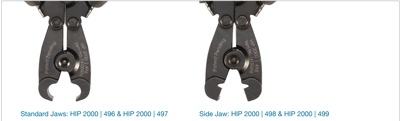
Standard Jaws: HIP 2000 | 496 & HIP 2000 | 497