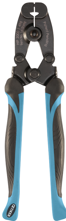
Compound Action Pincer - Side Jaws - Straight Handles HIP 2000 | 498