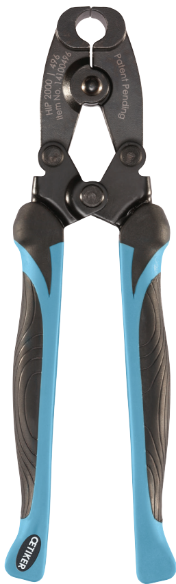
Compound Action Pincer - Standard Jaws - Straight Handles HIP 2000 | 496