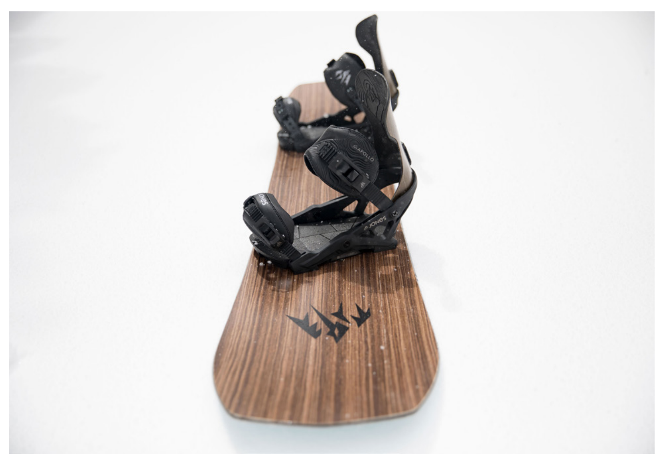
The new Flagship is available in 11 sizes including two new sizes - 151 (NEW), 154, 158, 159w, 161, 162w, 164, 165w, 167 (NEW), 169w and 172.

But just because it's green, the new Flagship is no less mean. We've completely redesigned the Flagship's shape for better turn performance. The new shape has a blunt nose, 12mm of taper from nose to tail and a refined 3D Contour Base 3.0 base design. The tapered shape sinks the tail in pow for better float and the 3D Contour Base 3.0 lets you rock the board edge-to-edge for smoother turns. On hard snow the directional rocker profile + Traction Tech 3.0 deliver epic edge grip and the FSC Control Core and Flax/Basalt Power Stringers add torsional response and reduce board chatter in rough terrain. Just like it's predecessors, the new Flagship carves, stomps or straight lines with unbelievable precision.