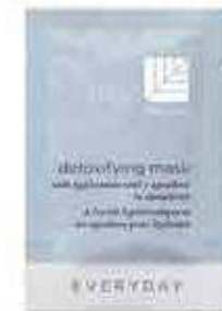
SAMPLE SA CHET 2 ml