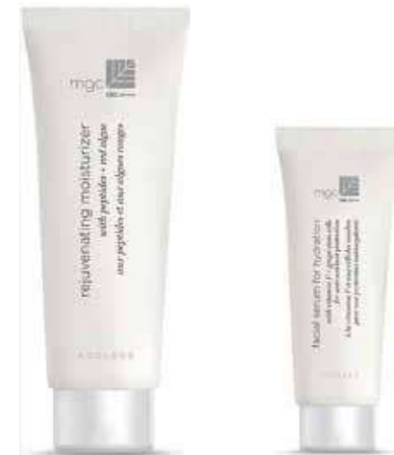
25ml + 7ml SAMPLE SIZES