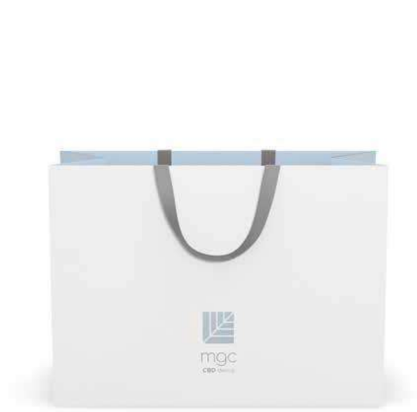
SHORT RIBBON HANDLE SHOPPER MATTE FINISH