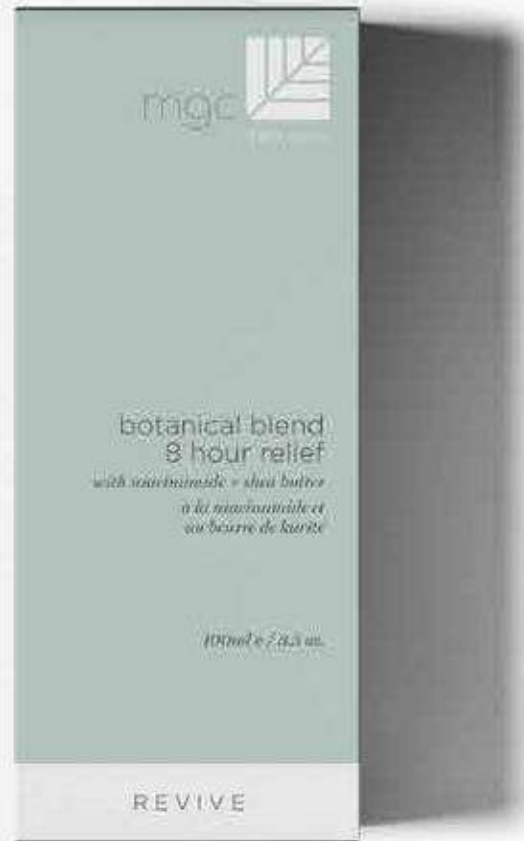
SOFT TOUCH BOX