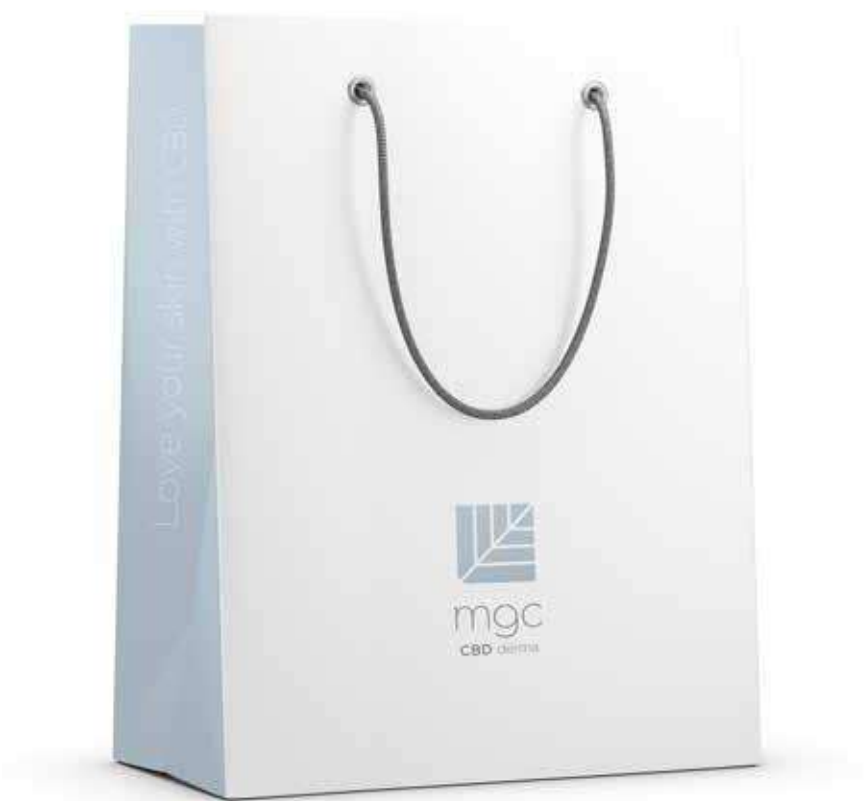
TALL ROPE HANDLE SHOPPER MATTE FINISH