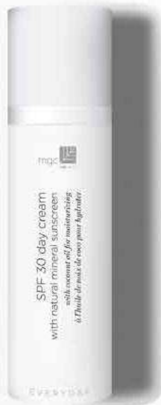
GERMAN ENGINEERED SOFT TOUCH AIRLES SPUMP 50 ml