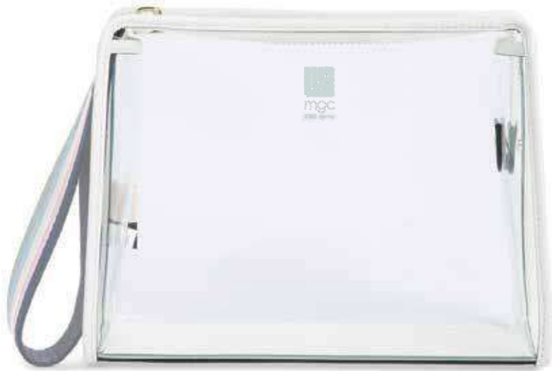
PERSONAL SIZED COSMETICS BAG