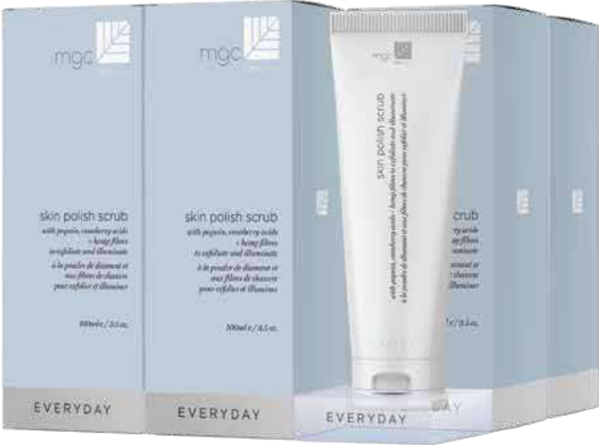
RANGE SPECIFIC CLEAR ACRYLIC/PERSPEX TESTER PLINTH