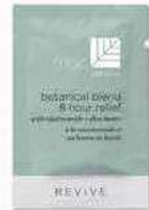
SAMPLE SACHET 2 ml