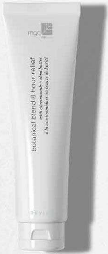
MA TTE FLIP TOP TUBE 100 ml