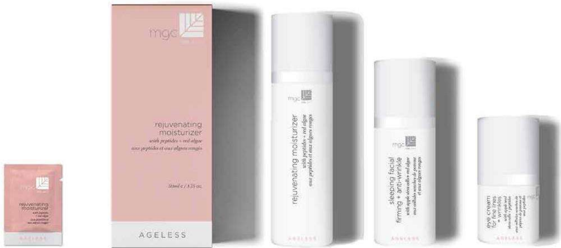
SAMPLE SACHET 2 ml