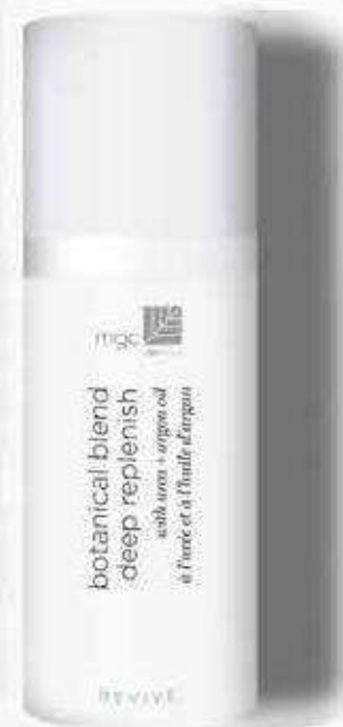
GERMAN ENGINEERED SOFT TOUCH AIRLES SPUMP 30 ml