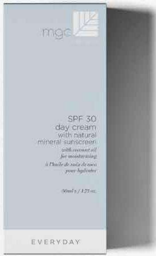
SOFT TOUCH BOX