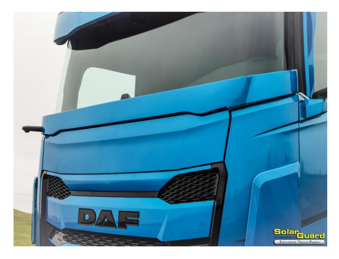
THE STONEGUARD COMES WITH 5 FIXED MOUNTING POINTS