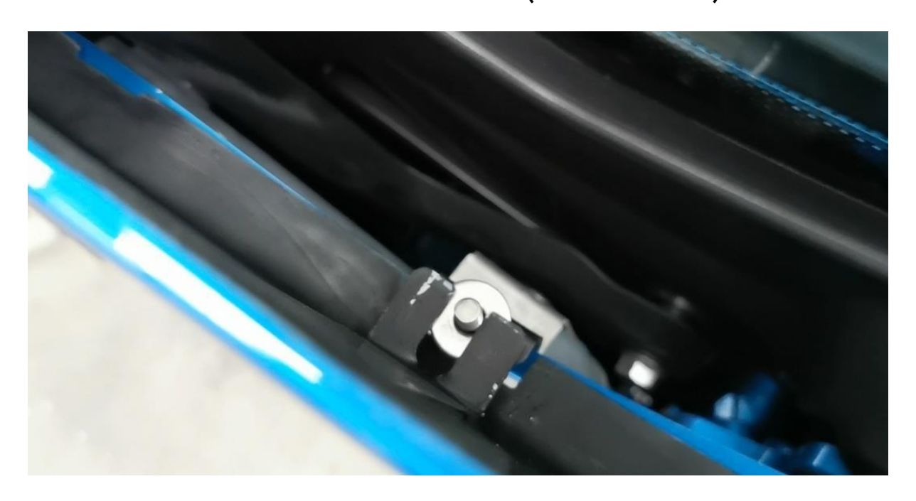
BRACKET POSITION 3 (MIDDLE BRACKET)