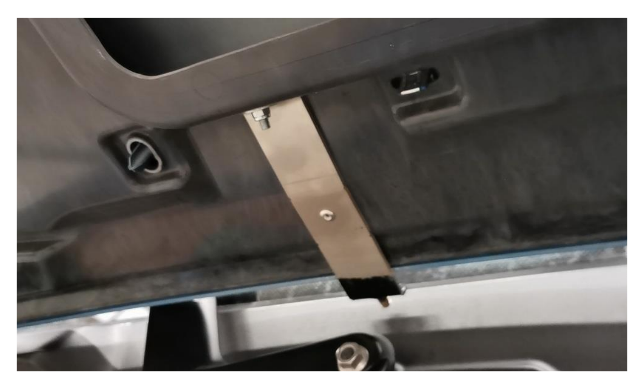
BRACKET POSITION 3 (MIDDLE BRACKET INSIDE VIEW) FIX WITH A NUT AND BOLT AND POP RIVET AS SHOWN.