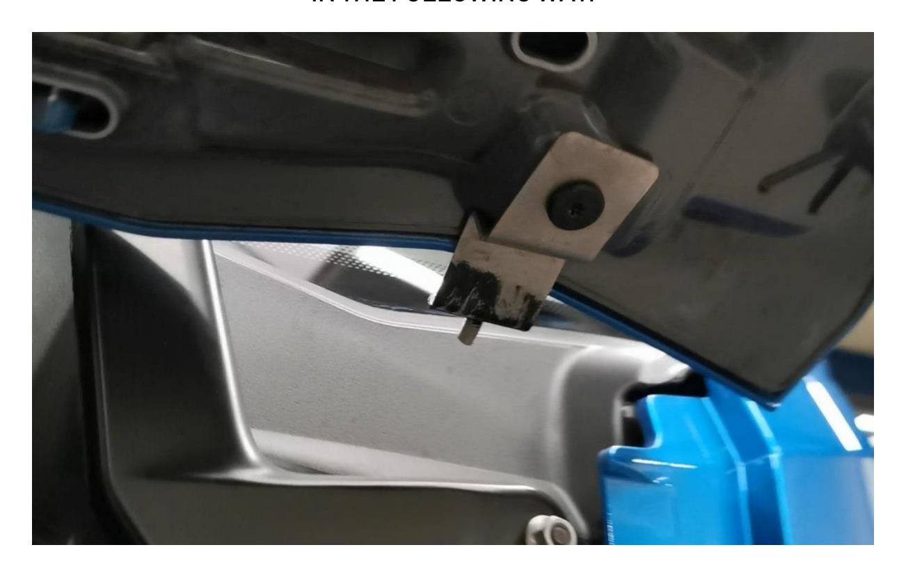
BRACKET POSITION 2 AND 4 (INSIDE VIEW)