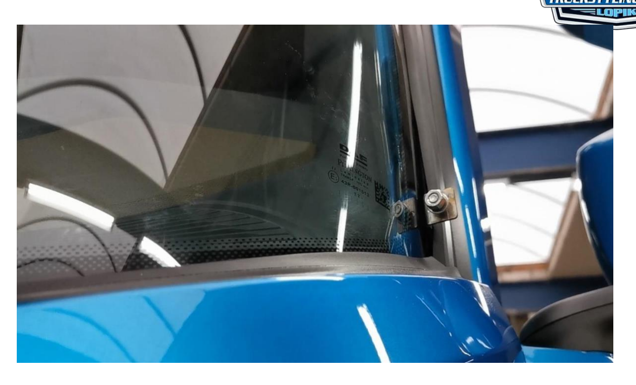
BRACKET POSITION 1 AND 5.