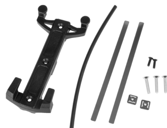
Quick-Lock S adapter plate incl. mounting accessories (included in delivery)