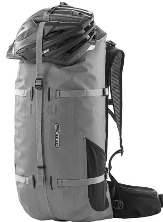
Application example: Attachment Kit for Helmets (helmet toggle for fixing helmets with larger ventilation slots)