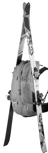
Application example: Attachment Kit for Gear (A-frame ski carrying)