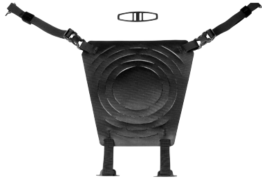
Attachment Kit for Helmets