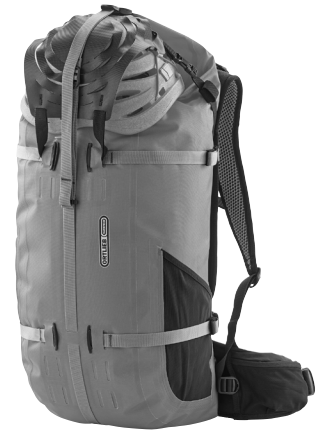
Application example: Attachment Kit for Helmets (universal mounting for various helmets and gear)