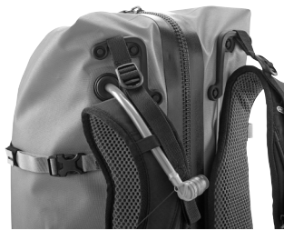
Waterproof hydration tube port