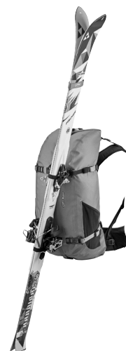
Application example: Attachment Kit for Gear (diagonal ski carrying)