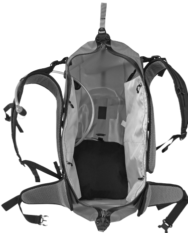
Application example: Hydration System