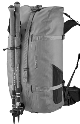
Application example: Attachment Kit for Gear (mounting trekking poles)