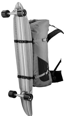
Application example: Attachment Kit for Gear