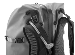
Attachment for hydration system (optional accessory)