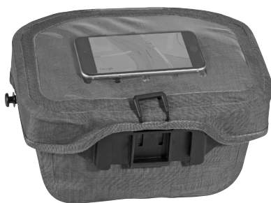
Smartphone in transparent lid compartment (not included)