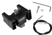
E225 Handlebar Mounting-Set