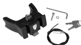
E207 Handlebar Mounting-Set E-Bike with Lock