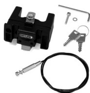
E185 Handlebar Mounting-Set with Lock