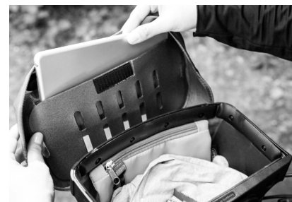
Opening lid compartment: 20,5cm / 8.1in.