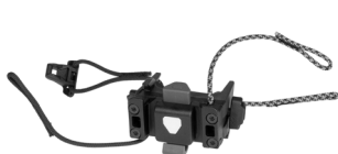
E241 Handlebar Mounting-Set QR

Handlebar mounting-set (sold separately):