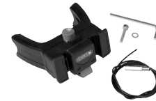
E226 Handlebar Mounting-Set E-Bike