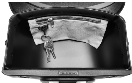
Carabiner with key chain

Handlebar mounting-set (sold separately):