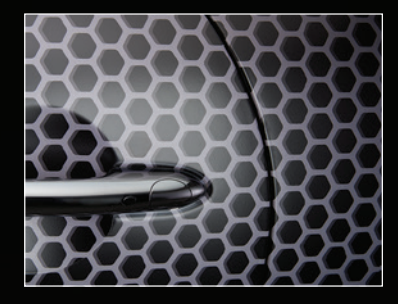
▲ Evenly cut in gaps between car panels.