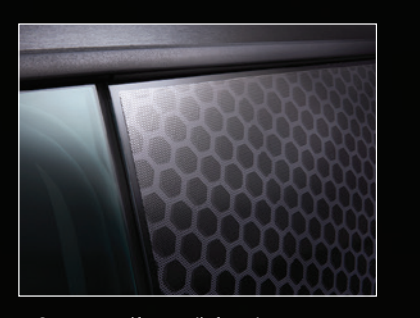
▲ Create a uniform relief cut between window graphic and rubber molding.