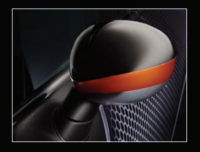
▲ Create unique accents and designs.