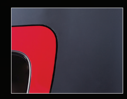
▲ Cut paint protection films crisp and clean during wet applications.