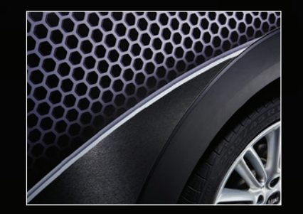
▲ Create a clean, seamless butt joint between two challenging films.