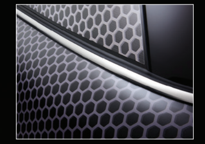
▲ Follow contours and curves on any part of the vehicle.